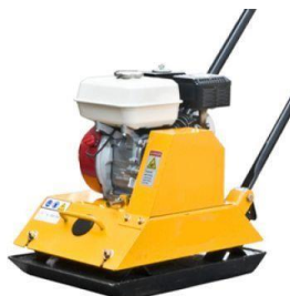
VIBRATING PLATE COMPACTOR