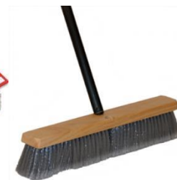
BROOM (FOR CLEAN UP)