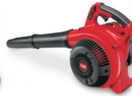
BLOWER (FOR CLEAN UP)