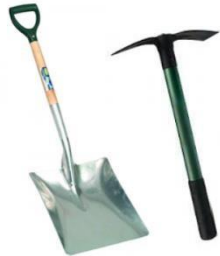
SHOVEL & PICKS