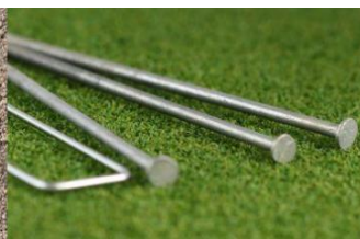
40D 5" / 60D 6" BRIGHT COMMON NAILS 6"X1"X6" STEEL STAPLES